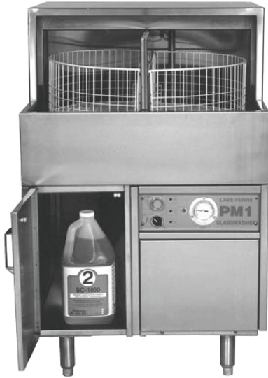
Built-in products storage space.